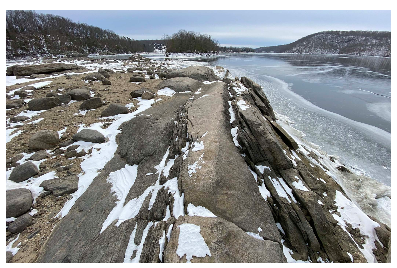
Candlewood Lake near Dikes Point during the January 2021 winter zebra mussel survey.