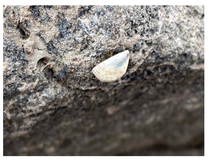
Zebra mussel found near the Route 39 causeway.