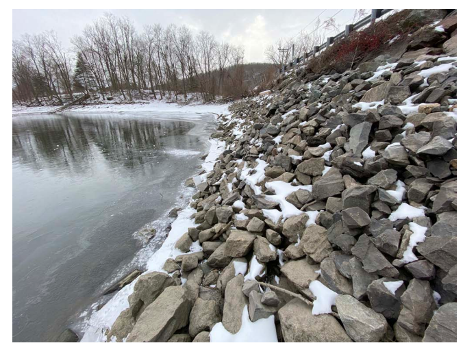
Route 39 causeway between Candlewood Lake and Squantz Pond, where one juvenile zebra mussel was found.