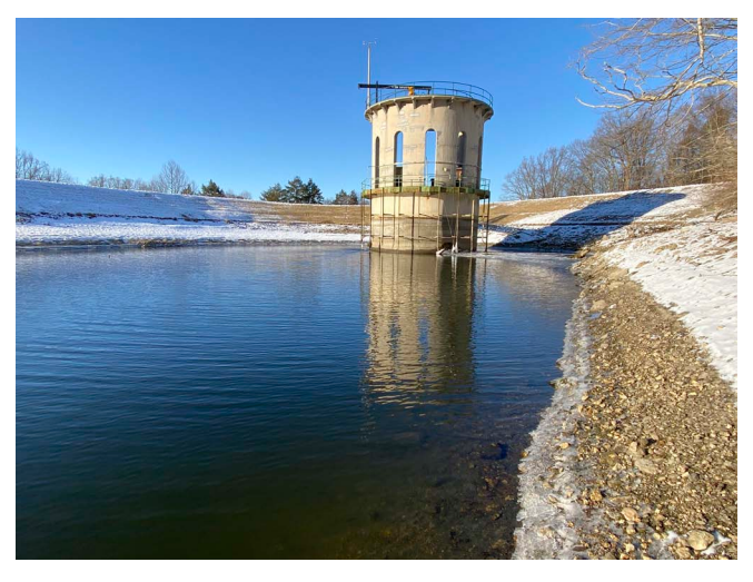
Rocky River penstock in January 2021, where two adult zebra mussels were found.

Candlewood Lake Spring Survey: Biologists detected live zebra mussels at Dive Sites 5, 7, and 9) (Figure