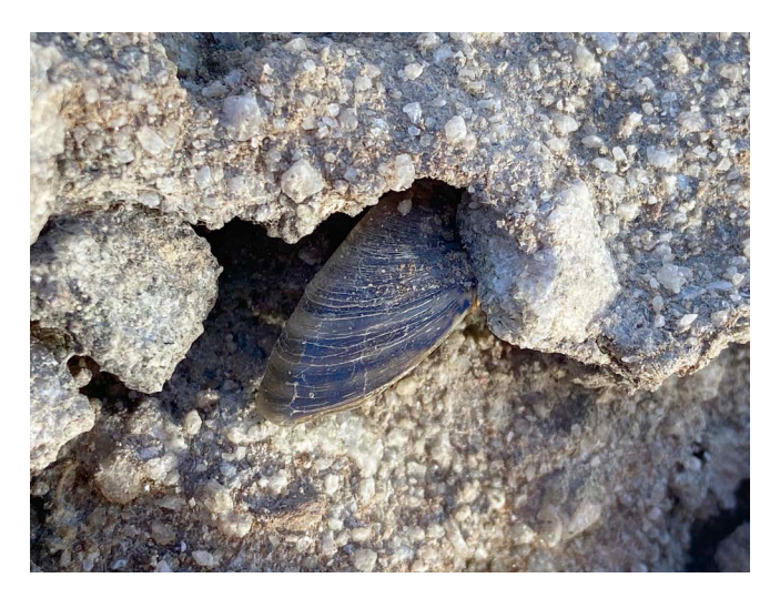
Zebra mussel found near the Rocky River penstock.