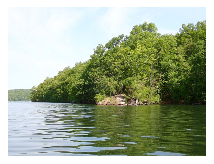
Candlewood Lake survey site 5, where two adult zebra mussels were found in May 2021.