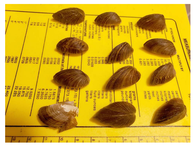
Zebra mussels found at the Rocky River tailrace.

1). At Dive Site 5, two were found at depths of 10.0 and 12.0 ft (419.0 and 417.0 ft, respectively). At Dive Site 7, two were found at depths of 12.0 and 16.0 ft (417.0 and 413.0 ft, respectively). At Dive Site 9, one was found at a depth of 13 ft (416 ft). Shell lengths ranged from 16.5 to 29.5 mm (average = 22.1 mm), and these could have all settled during the previous year. Most were likely sexually mature and capable of reproducing in 2021. As in previous years, biologists detected low densities of Asian clams and native mussels (eastern elliptio and eastern floater) throughout Candlewood Lake.