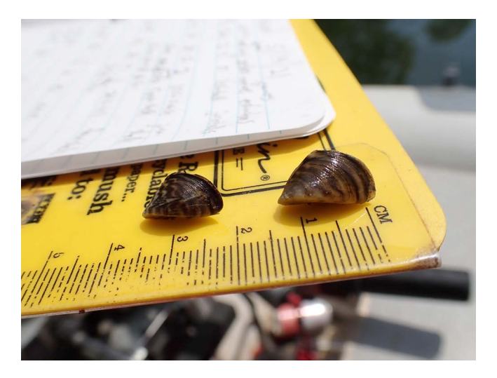
Zebra mussels found at Candlewood Lake survey site 5.